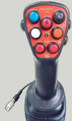
Electronic cobra control